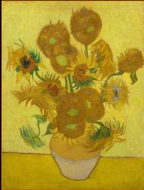
Sunflowers , January 1889 Vincent van Gogh (1853 - 1890) Van Gogh Museum, Amsterdam (Vincent van Gogh Foundation)

‘In our opinion, the photographs that we offer on our website do comply with the above criteria [originality].