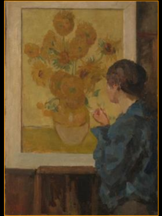
Woman Standing in Front of Van Gogh's Sunflowers, 1915-1920