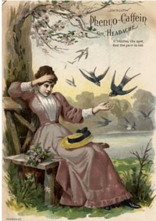
Flickr The Commons PD / No Known Copyright Restrictions Swallow Phenyo-Caffein for headache: it touches the spot, and the pain is not National Library of Medicine – Archives of Medicine – NLM-NIH