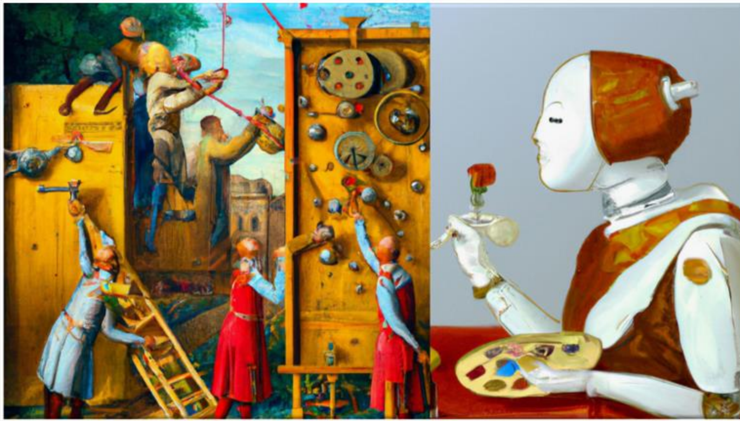
Image: “ AI Inputs and Outputs ” by Creative Commons was made from details from two images generated by the DALL-E 2 AI platform with the text prompts “A Hieronymus Bosch triptych showing inputs to artificial intelligence as a Rube Goldberg machine; oil painting” and “a robot painting its own self portrait in the style of Artemisia Gentileschi.” CC dedicates any rights it holds to the image to the public domain via CC0 .